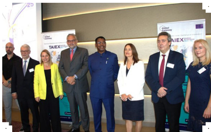
TAIEX INTPA Workshop on Supporting the National Anti-corruption Framework in Namibia

In Namibia , a TAIEX workshop supported the development of a national framework for corruption risk management in public bodies. Experts from Germany, Lithuania, Slovenia, and Romania worked with the Anti-Corruption Commission of Namibia , reinforcing transparency, accountability, and institutional integrity — a strong example of EU values in global action.