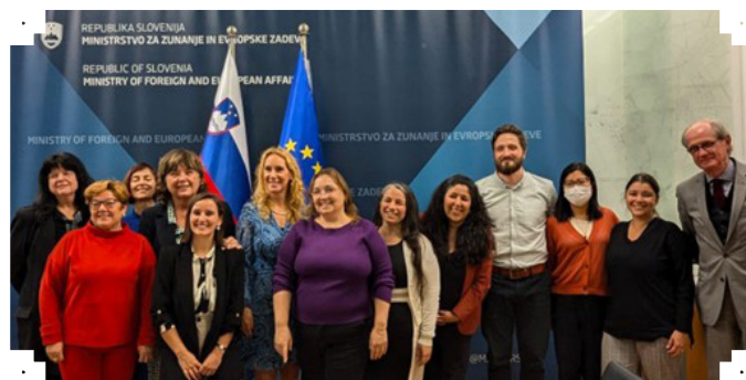
TAIEX INTPA Study visit Regional EU-LAC activities on AI

In 2024, TAIEX delivered high-impact support to global digital transformation through a study visit under the EU-LAC Digital Alliance on Artificial Intelligence , co-led by Brazil, Chile, and Uruguay. Hosted in Slovenia and Spain, the initiative strengthened institutional capacities in AI governance, data protection, and innovation ecosystems . It empowered public officials from Latin America and the Caribbean with practical knowledge on AI regulation, entrepreneurship, and high-performance computing, helping partner countries shape forward-looking digital strategies and foster responsible AI development.