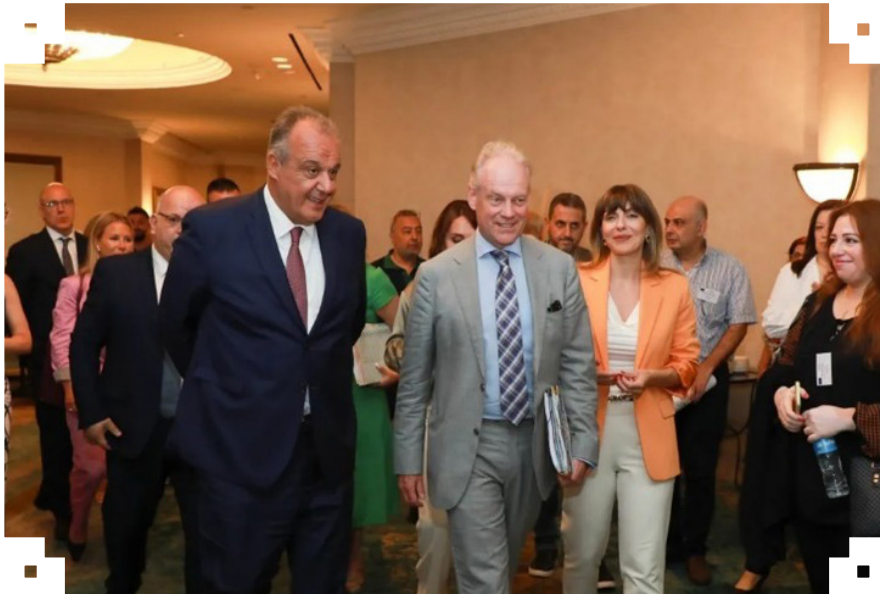
TAIEX Workshop on Plastic Value Chains: Enhancing Quality, Competitiveness and Sustainability in Recycling in Lebanon

One standout example was the TAIEX workshop on Plastic Value Chains in Beirut, which gave a strong boost to Lebanon's green industrial transition, responding to the country's urgent economic and environmental challenges. By promoting sustainable production, circular economy practices, and alignment with EU standards, the workshop supported the development of cleaner industries, higher-quality products, and the creation of new green jobs.