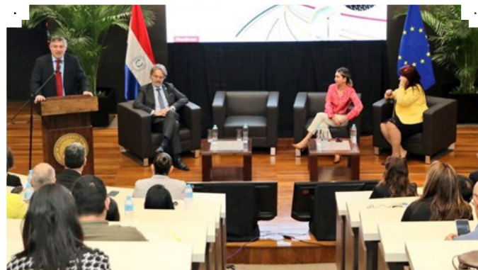
TAIEX INTPA Workshop on Technical and Vocational Education and Training (TVET) in Sustainable Forest Management in Paraguay

Paracel investment , a major cellulose production project. Experts from Germany, Spain, Portugal and Finland shared good practices on green skills, labour market policies and education system reform to prepare for the socio-economic impact of the investment in the Department of Concepción.